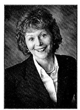
Each Office Is Independently Owned And Operated.