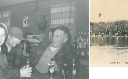
Unknown patrons at Boiling Springs -Date unknown Can anyone identify the folks in this photo?